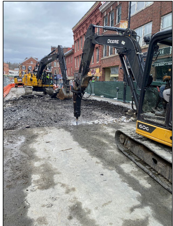
Hebert Excavation removing the roadway on State Street.