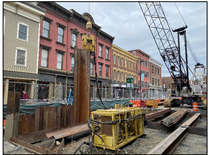
Sheet piles being installed by a crane on State St.

State Street is currently closed to vehicle traffic this week while the contractor installs sheet piles into the ground. If you look on State Street in the construction zone, you'll see four sheet piles sticking up higher than the rest—that indicates there's something in the ground the sheet piles cannot pass through. The contractor is going to keep going with the remaining piles, but they will need to pay some special attention to the piles that aren't in all the way. Most likely, they will need to dig down and find out what's blocking the piles. This can be a noisy process, so be sure to grab a pair of earplugs from the dispenser bucket at the corner of State & Main if you'll be spending time outside near the construction zone!